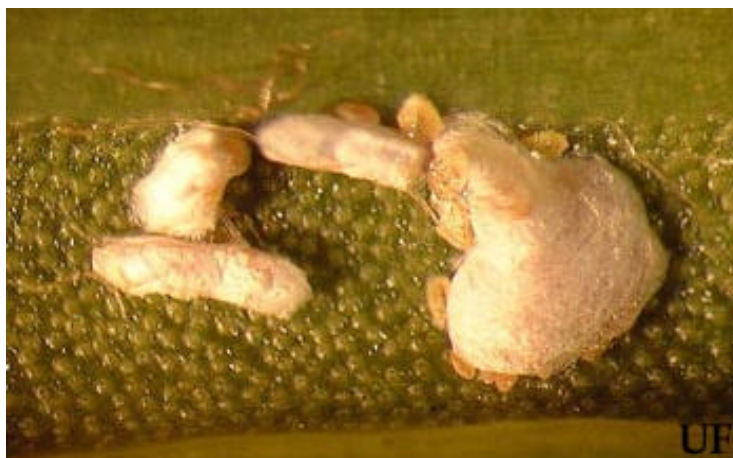
The smaller scales above are the males. The larger scale is female.

In general, scale insects hatch into a "crawler" stage capable of movement. When they find a suitable spot on a plant, they insert their mouthparts, called a stylet - (much like a straw), into the plant and start feeding. Shortly afterwards they begin to create a covering over themselves. They will stay this way until they die.